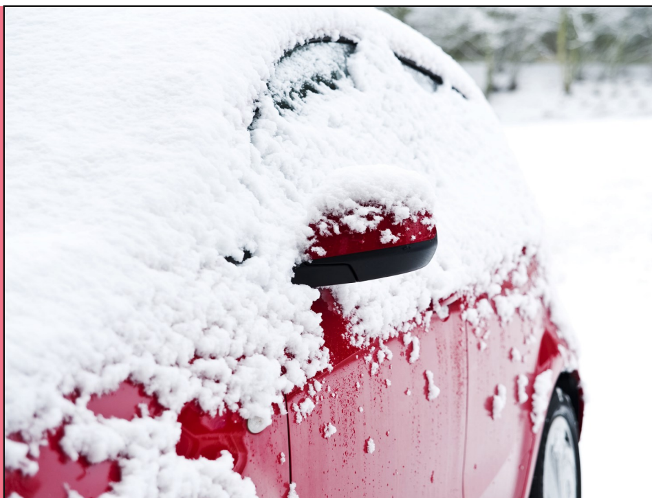
Is your car covered in snow?

"Thank you mom for making me food so I don't die."