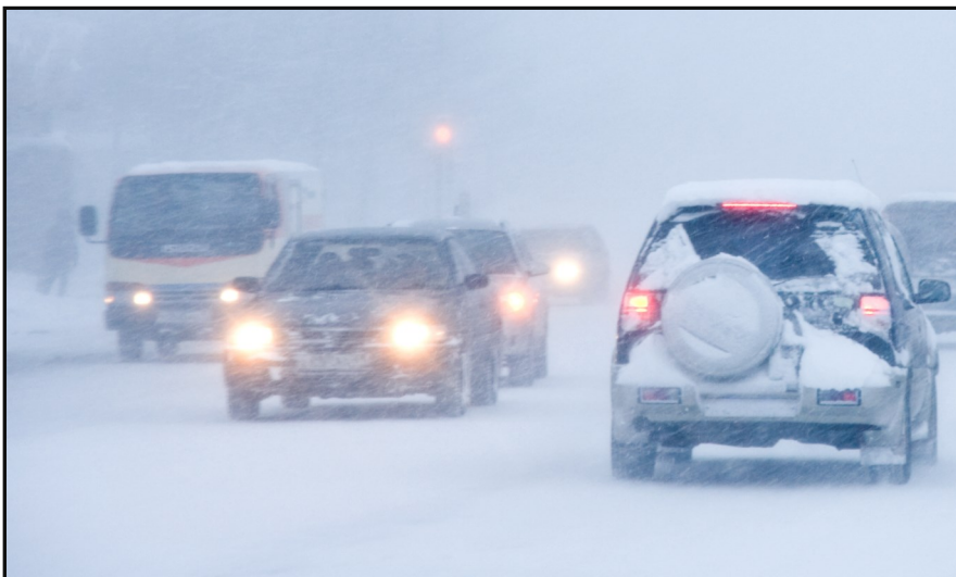
Winter drive time!