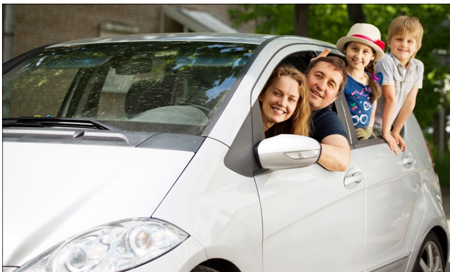
Family Enjoying the Season