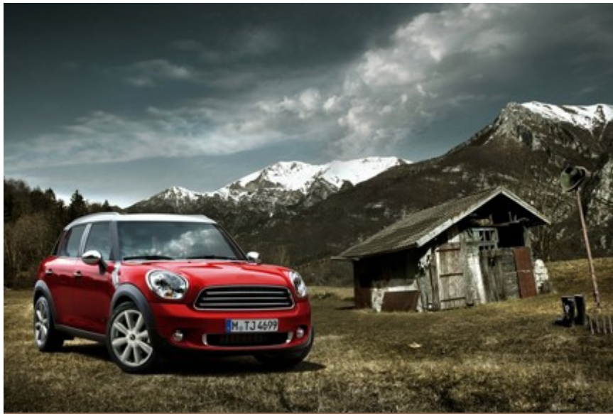
Mini Cooper Countryman